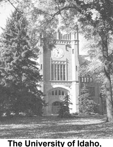
founded in 1889, is Idaho's oldest universitv

political The stability of the territorial period encouraged settlement. A public school system was created, stage coach lines were established and a newspaper, the Idaho Statesman, began publication. In 1865, Boise replaced Lewiston as capital. The 1866 discovery of gold in Idaho and the completion of the transcontinental railway in 1869